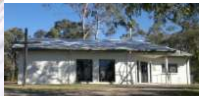
Left: St Peter's Church today.

Sixteen Hidden Books: I once made a remark about the hidden books of the Bible. It was a lulu, kept people looking so hard for facts and for others it was a revelation. Some were in a jam, especially since the names of the books were not capitalized, but the truth finally struck home to numbers of readers. To others it was real job. We want it to be a most fascinating few moments for you. Yes, there will be some really easy ones to spot. Others may require judges to help them. I will quickly admit it usually takes a minister to find one of them and there will be loud lamentations when it is found. A little lady says she brews a cup of tea, so she can concentrate better. See how well you can compete. Relax now, for there really are sixteen names of books in the bible in this story.