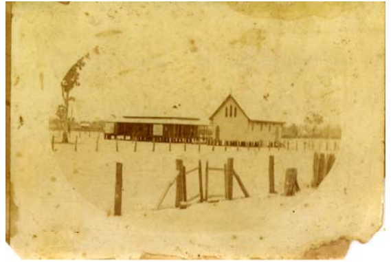
Photo: St. Lukes Emerald church and Mission House, Easter-tide 1900.

Special parish news has always been a major part of The Church Gazette of the Diocese of Rockhampton. Some of the news reported by parishes leading up to and during 1906 includes: