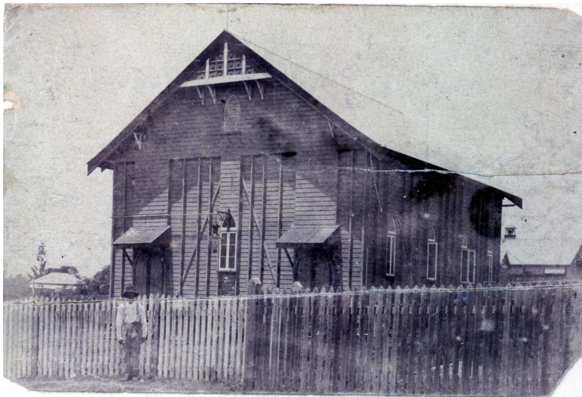
St Lukes Church circa 1920

At the beginning of 1901, the area in which St Lukes church had been built was being called “Wandel’s Estate”, with various spelling of “Wandal”, “Wandel” and “Wandall” for some time. The church was often referred to as “St Lukes, near Wandel’s Estate”.